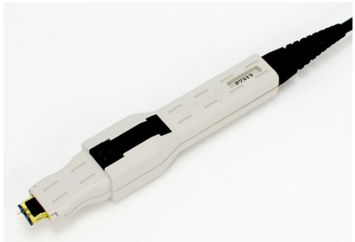
Handheld Adapter (HHA) accessory

Handheld and fixtured probing needs are met using the Handheld Adapter and Variable Spacing Tip-Clips.