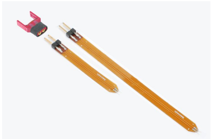
Quick Connect Flex Solder tips

The Quick Connect Flex Solder tips can bend in multiple axes allowing them to avoid obstacles on a circuit board, such as heat sinks, connectors, or tall components.